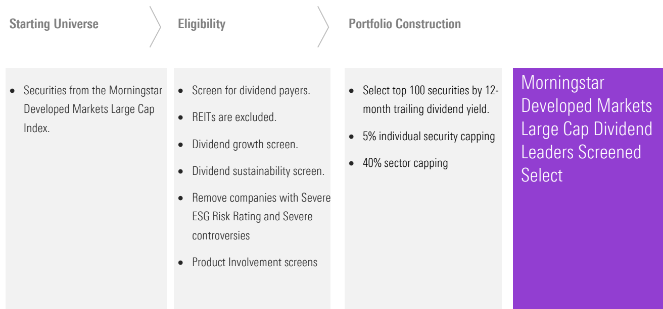
Exhibit 1: Construction Process