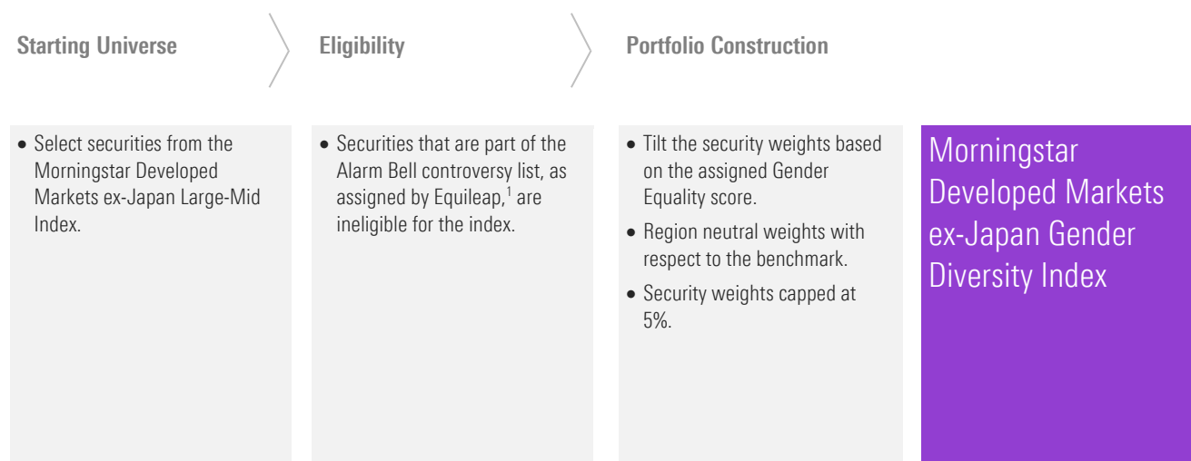
Exhibit 1: Construction process